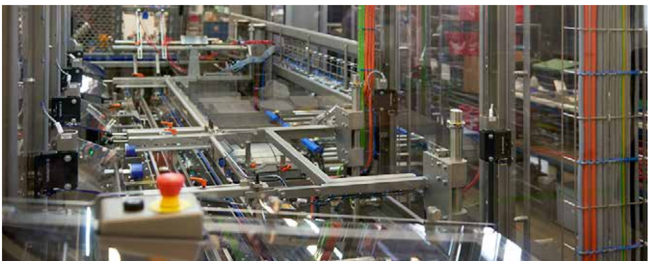
Different concepts for machine safety: „Safety integrated“ or „Safety separated“.